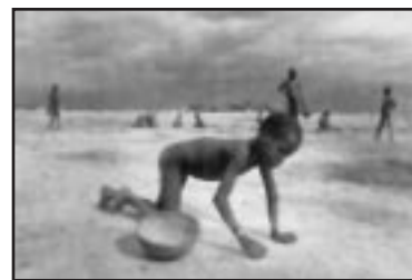
Child Picking Ants

The Region of the Americas is a land of contrasts where in most of the cities down the Rio Grande enormous disparities coexist. Only 26% of the population of Latin America and the Caribbean resides in rural areas. The cities house 355 million people. Nearly 40% of urban households are under the poverty line (CEPAL, 1995). Inadequate housing is the only solution available for 38% of the population.