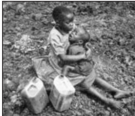
Holding on to Life