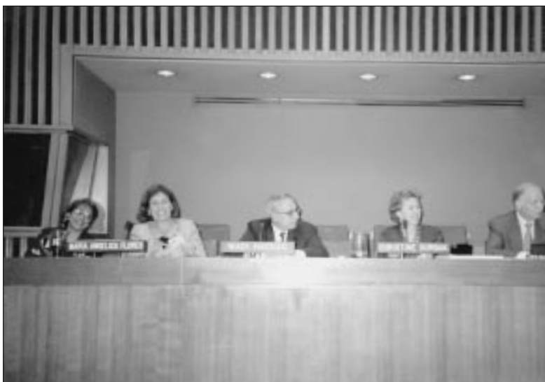
Speakers at the 6th Conference on Health & Environment at the United Nations April 18, 1997

This year, World Information Transfer's sixth annual conference, Health and Environment: Global Partners for Global Solutions, addressed the critical connection between environmental degradation and the health of children. As children, humans require more air, water, and food per body weight than we do as adults. Children have higher metabolic rates and are developing at a much faster rate. For these reasons, children feel the force of environmental degradation much more acutely than do adults. They have not yet developed sufficient tolerances, immunities, or resilience to common pathogens and pollutants and are therefore more vulnerable to disease. Even relatively slight adversity, if it is encountered at a particularly sensitive point in development, can retard growth and